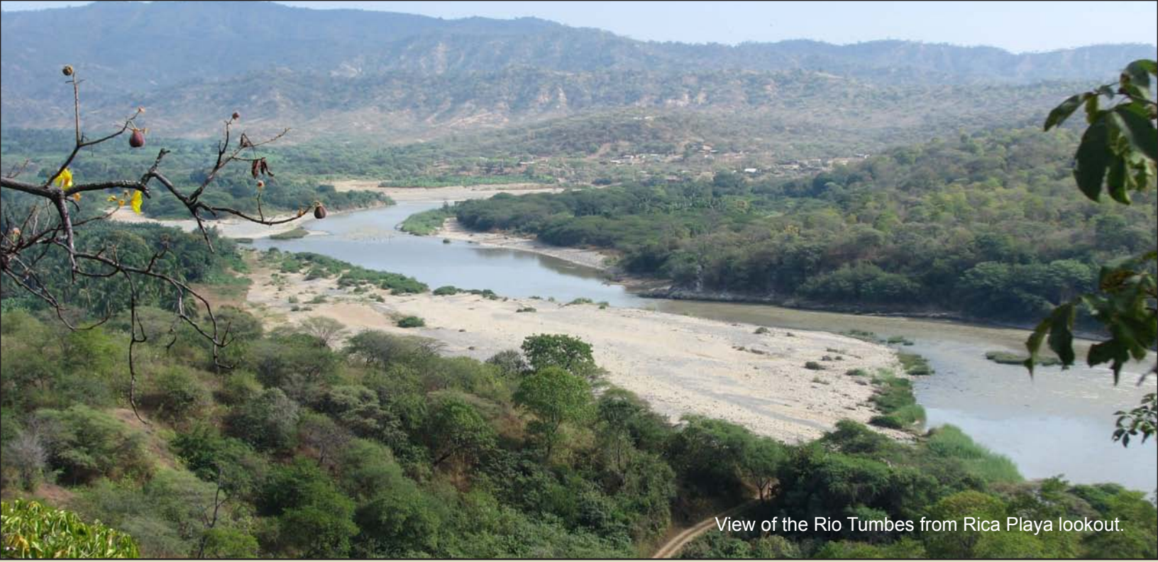
View of the Río Tumbes from Rica Playa lookout.

erythrocephalus ), and the Ochraceous Attila ( Attila torridus ), just to name a few. A great deal of time was spent exploring these montane forests due to their relative species richness and the exciting prospect of documenting range extensions for birds from nearby Ecuador.