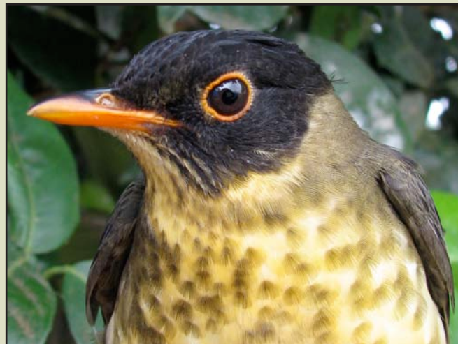
The great singer Spotted Nightingale-Thrush ( Catharus dryas ), was restricted to the more humid areas of the Tumbes department.