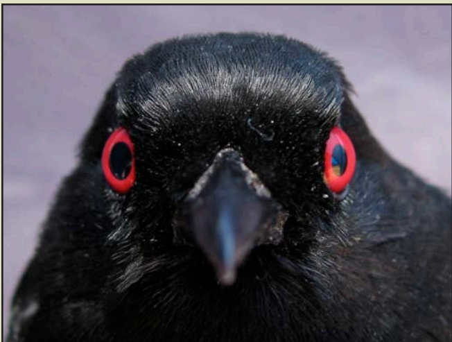
The west-slope form of the White-backed Fire-eye ( Pyriglena leuconota ). The western populations of certain species are poorly represented in museums.

mentation of species previously observed but not collected in Peru. Moreover, one species collected was a new addition to the known avifauna for the country: the Rufous-tailed Hummingbird ( Amazilia tzacatl ). The specimens themselves have been divided evenly and will be housed at CORBIDI in Peru and LSUMNS here in the United States. Specimens from such an endemic-rich area will be a solid contribution to the diversity of taxa represented in ornithological collections. The findings of the expedition are also an invaluable asset in emphasizing the importance of conserving such unique ecosystems as those found in Tumbes. The expedition was also a great adventure for its participants, veteran and novice alike, who were filled with priceless experiences and memories that will last a lifetime, from a truly unique place in tropical South America.