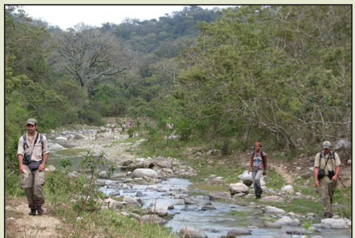
LSU alumni Jacob Saucier , Phred Benham , and Sheila Figueroa from CORBIDI hike the trail to Cerro El Platano camp.

Tumbes' diverse range of habitats (deciduous forests, arid coastal scrub, dry foothills, coastal mangroves, and montane humid forest) resulted in an exciting and ever-changing aspect to the expedition. Once established, the expedition team was eager to go about recording and collecting representatives from the local avifauna. The area had an impressive bird roster that included a substantial component of endemic specific and subspecific taxa, such as the Rufous Flycatcher ( Myiarchus rufus ) and Collared Antshrike ( Thamnophilus bernardi ) of the drier foothills, and mangrove specialties such as the distinct Tumbes form of the Clapper Rail ( Rallus longirostris ) and Rufous-necked Wood-Rail ( Aramides axillaris ). The more humid deciduous forests of the Amotape Mountains were home to other feathered gems such as the Gray-and-Gold Warbler ( Basileuterus fraseri ), Henna-hooded Foliage-Gleaner ( Hylocryptus