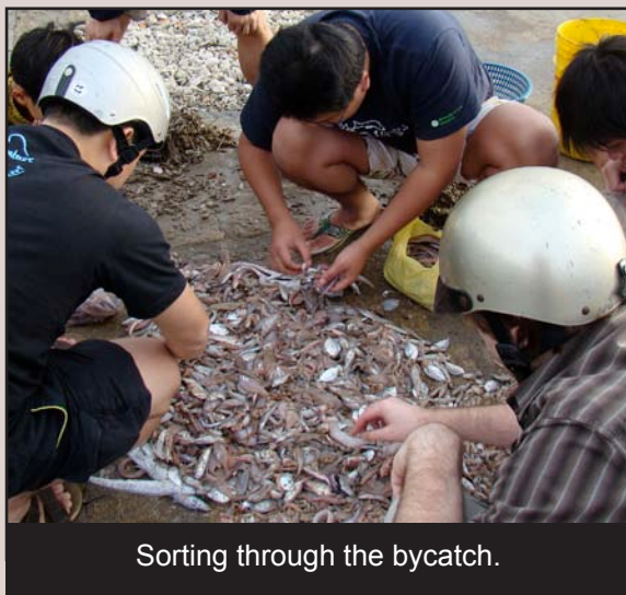
Sorting through the bycatch.

Near the end of the trip we went out collecting on the Mekong Delta. It took some work getting to the Mekong and hiring a boat but once aboard we would ask our driver (ask as in --point to a boat and to a picture of a fish) to take us toward the small fishing boats trawling the Mekong. It was by trading with boatman that we collected some of the most interesting freshwater and brackish water specimens. Nearly every specimen collected is new to the LSU collection, and some are certainly new to science. The products of the trip will be additional materials for our on going projects on the family level phylogenies of some notable deepsea, bioluminescent, and otherwise poorly studied Western Indo-Pacific taxa.