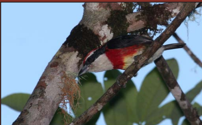
A new taxon of Capito barbet discovered by the team in the Cerros del Sira of Peru.