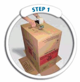
SET UP BOX