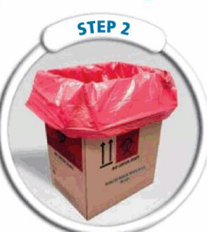
LINE BOX WITH RED BAG