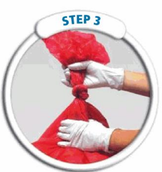
TIE BAG WHEN BOX IS FULL