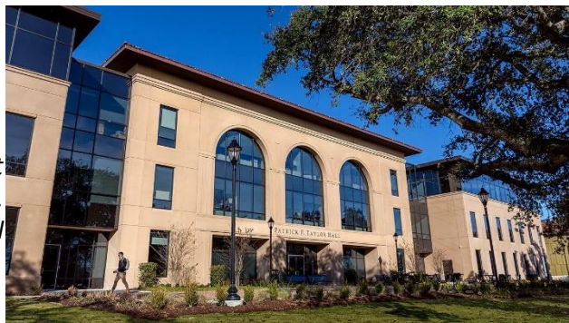
Image: Front of Patrick F. Taylor Hall

A parking pass will be emailed to you prior to arrival. Extra passes can be found at employer check-in. Parking will be reserved in the lot across the street from Patrick F. Taylor Hall. The lot entrance is named "314 Touchdown Village West Lot" and is also known as the x-174 lot.